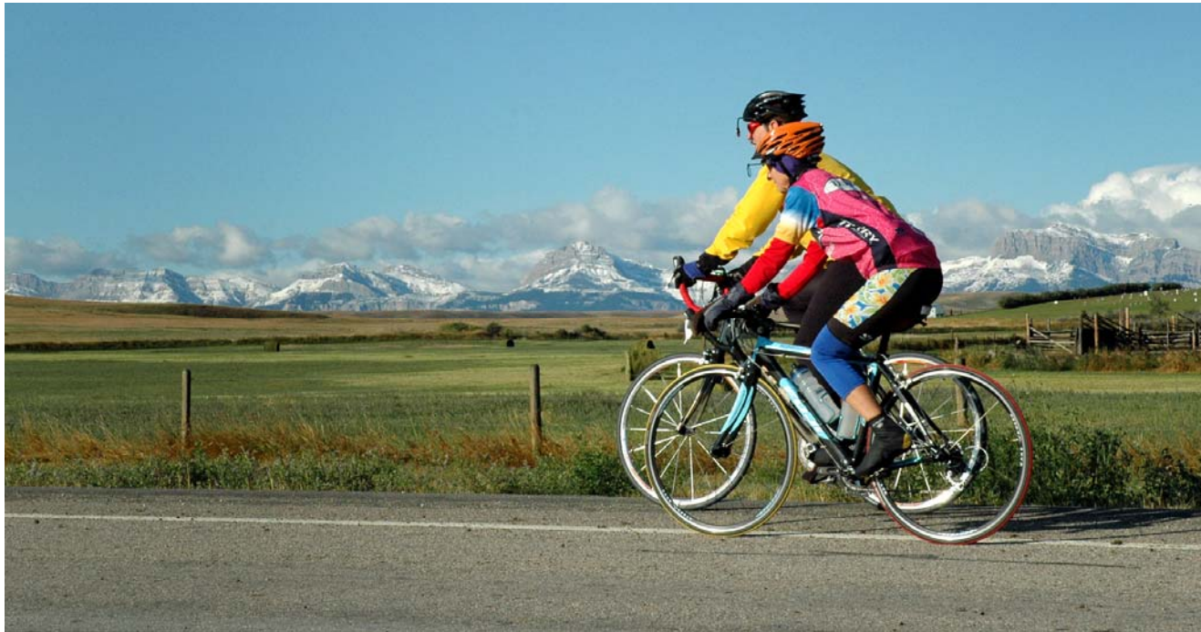
Riders in Park-2-Park Montana 2008 leave Dupuyer headed toward Great Falls. The Rockies can be seen in the background.

Glacier to Yellowstone - Sept. 7-11, 2009