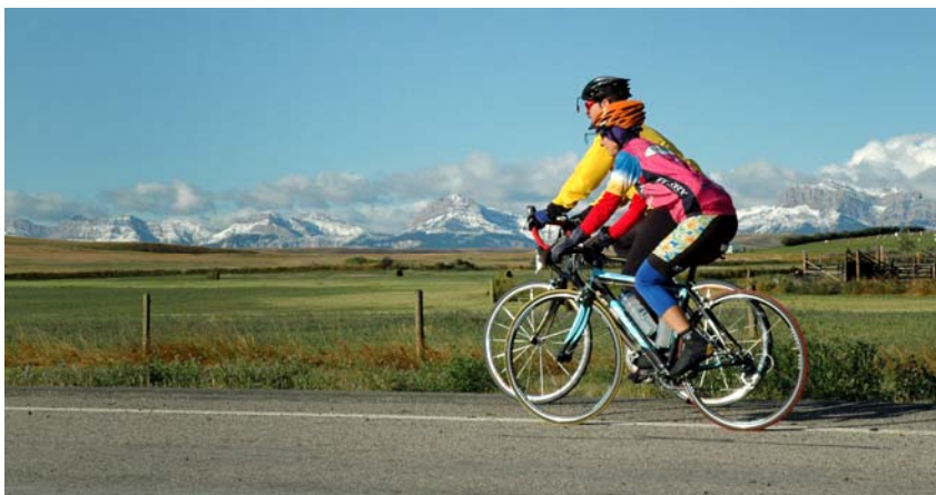
Riders in Park-2-Park Montana 2008 leave Dupuyer headed toward Great Falls. The Rockies can be seen in the background.

Glacier to Yellowstone - Sept. 7-11, 2009