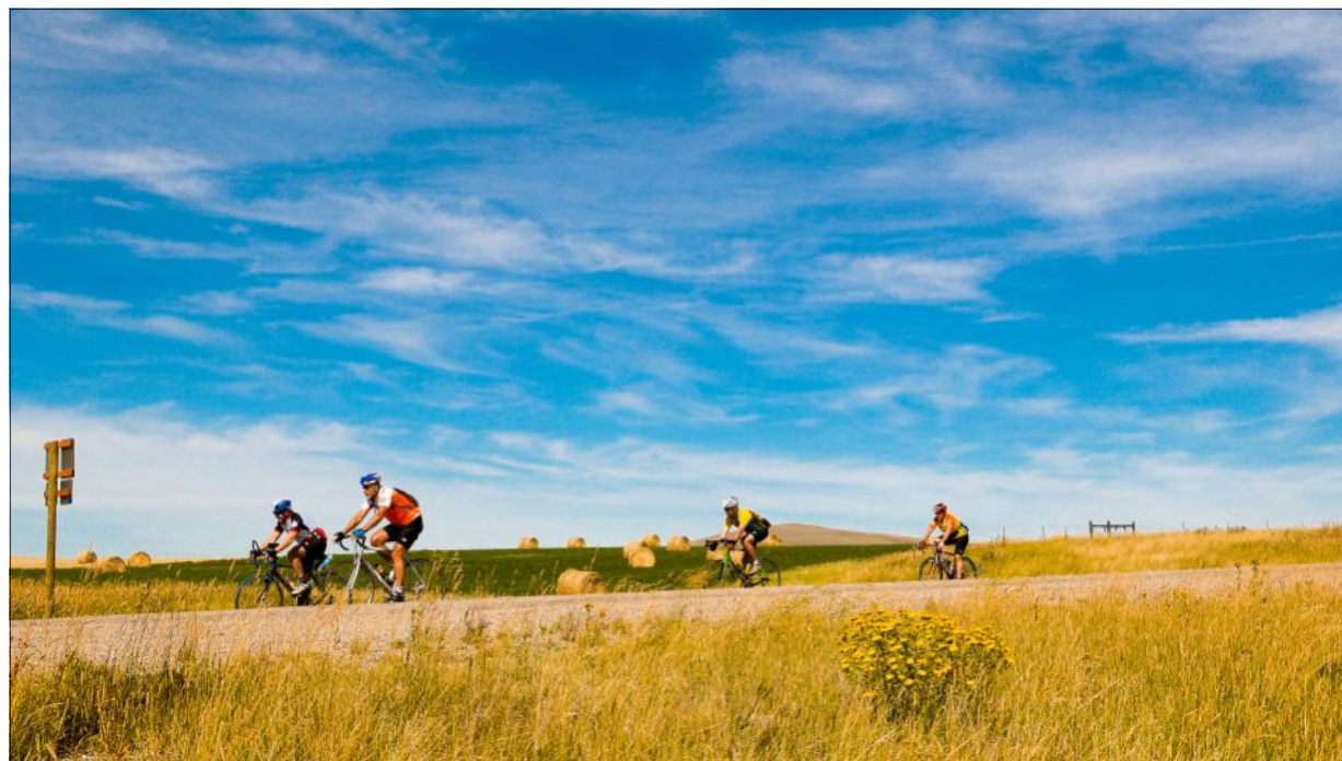
Riders in Park-2-Park Montana 2009 ride south to Monarch, Mt.