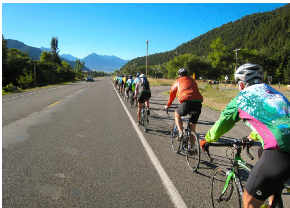
A pace line on the last leg of the journey to Gardiner, Mt. 2009

"Park-2-Park was a wonderful experience for me. While I was expecting a great experience the actual event exceeded my