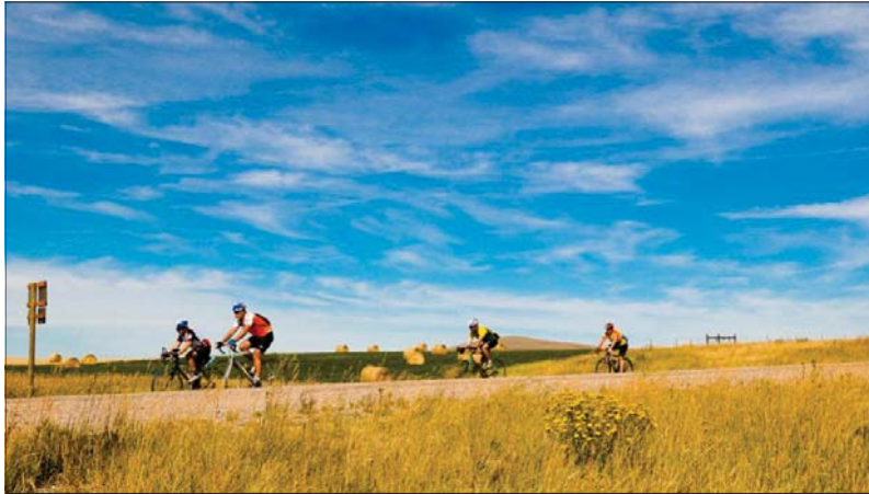
Riders in Park-2-Park Montana 2009 ride south to Monarch, Mt.

Glacier to Yellowstone - Sept. 6-10, 2010