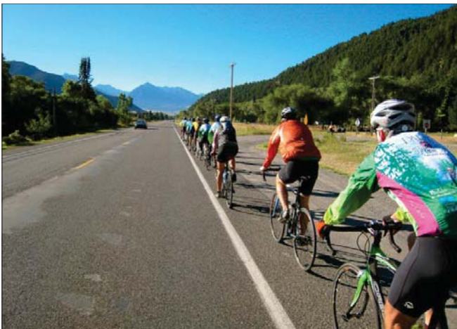
A pace line on the last leg of the journey to Gardiner, Mt. 2009

"Park-2-Park was a wonderful experience for me. While I was expecting a great experience the actual event exceeded my